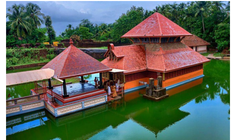
Ananthapura Lake Temple