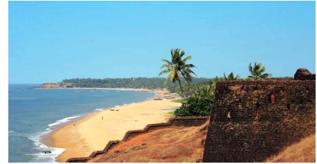
Bekal Fort Beach