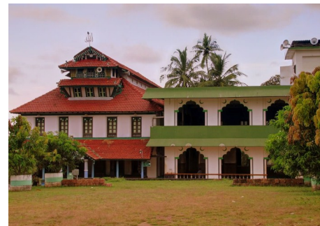
Malik Deenar Mosque